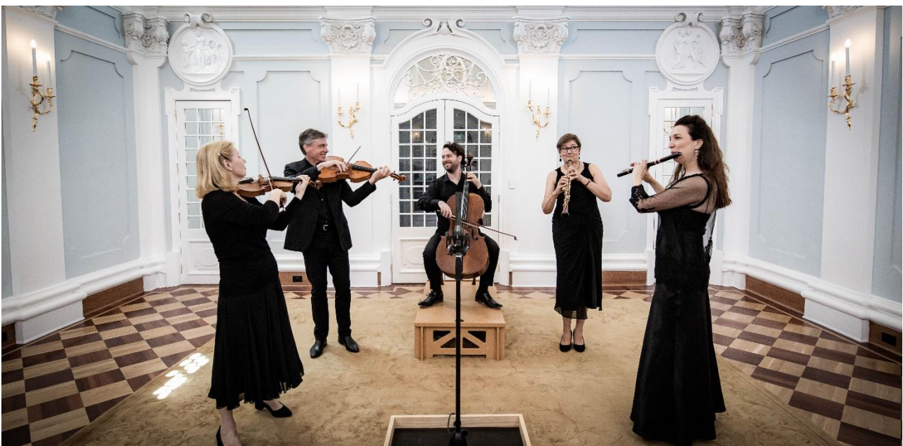
North Adelaide Baroque Hall.